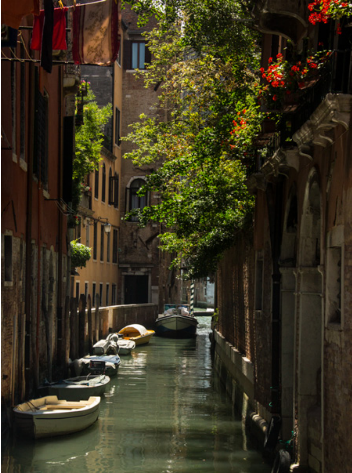
Canal and Greenery