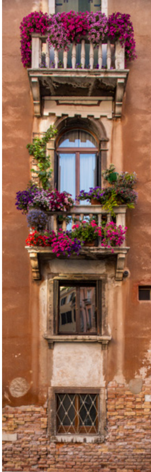
Windows and Flower Boxes